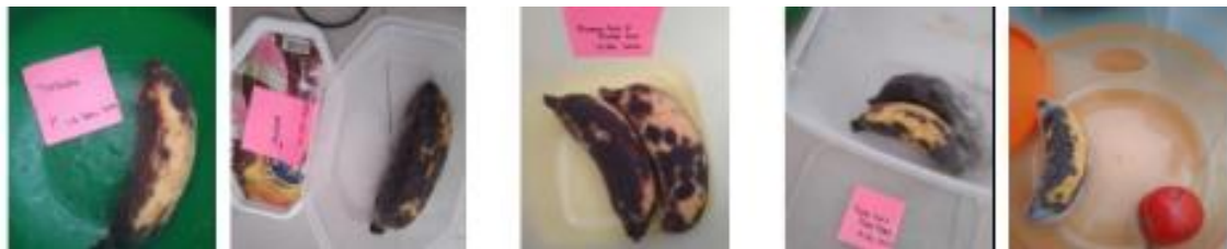
Fig. 2. Condition of bananas and tomatoes on the seventh day

Bananas are a climacteric fruit type, characterized by a high respiration rate during the ripening process. Initially, the bananas were at two different ripening stages: mature (yellow) and unripe (green). After one week of observation, the bananas showed changes in color, aroma, and texture. The color shifted from yellow or green to black, the aroma became strongly pungent, and the texture softened (Figure 2). These changes are attributed to over-ripening. According to Giovannoni (2004), fruit ripening is a complex genetically programmed process that results in significant changes in color, flavor, aroma, texture, and nutritional value.