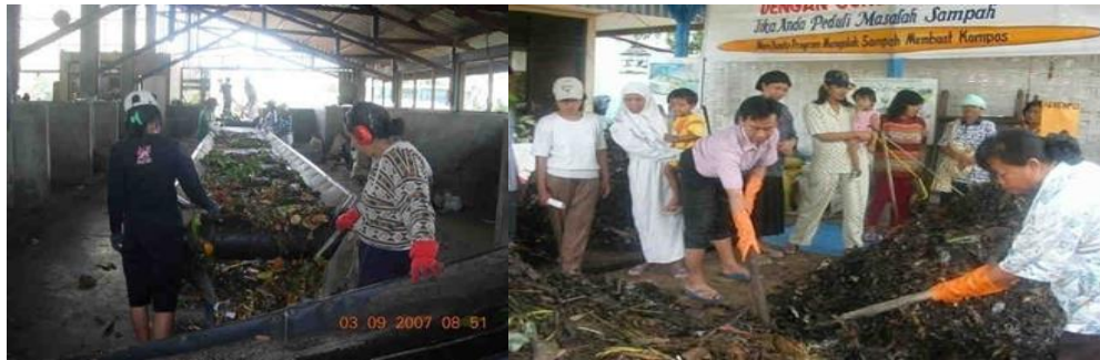
Figure 3. Regional Scale Processing Process