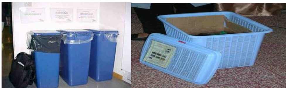
Figure 2. Individual Scale Processing

Based on the management responsibility data processing method, the processing scale can be divided into several scales, namely: First there is the individual scale; namely processing carried out by producers of waste directly at the source (household/office). An example of processing on an individual scale is waste sorting or composting on an individual scale.