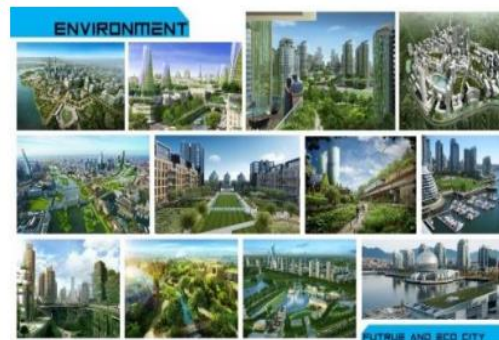
Gambar 2 Aspek lingkungan

This vehicle's design can be anticipated to contribute to environmental protection against different types of pollutants and pollution environment, as well as the creation of a green environment.