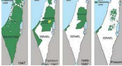
Fig 2. Data table of the number of Palestinian civilian casualties against Israeli attacks (Goodstat)

These injustices occur in various fields, such as economic, political and social. This injustice can cause tension and conflict between countries and communities. In addition, the Islamic world also faces the challenges of globalization. Globalization brings rapid and significant changes in various aspects of life. These changes can cause disruption and conflict, especially for unprepared communities (Rahmat, 2018). According to Islam as a very rationalist religion, it is able to create relationships between one society and another and can build an Islamic-based study of international relations. In the Islamic perspective, international relations are built based on the principles set forth in the Quran and Hadith. One of these principles is the principle of justice. Justice in international relations can be realized through cooperation and mutual respect between countries (Rahmatullah, 2021).