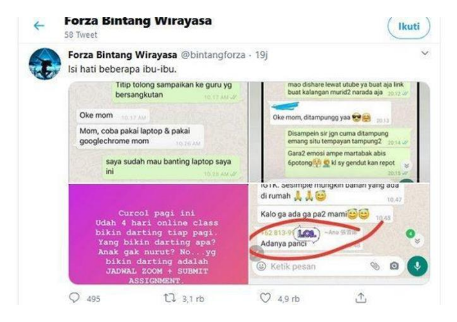
Figure 1. Expression of Frustrated Moms as they assist their kids to learn online (DeBritto, 2020)

The impact of online learning on students and their parents also puts them under stress. This burden is getting heavier, especially for housewives who also continue to work online and have children whom are still at early school age (Raihana, 2020). The following is an example of a thread on the Twitter social media platform, blaming the teacher as those who have the negative impact of online learning on students' parents. This post describes the dialogue of a group of housewives who are annoyed by female teachers during online mentoring. It can be seen in the post, even though the teacher responds politely, by saying that the complaint will be followed up, or the teacher advises the mother to use a laptop instead of a smartphone, or to find something at home to use as supporting learning tools. Ironically, the response -expressing annoyance- to the teacher's suggestion is "I only have cooking pots at home", or "I am now at the point of smashing my laptop to the floor".