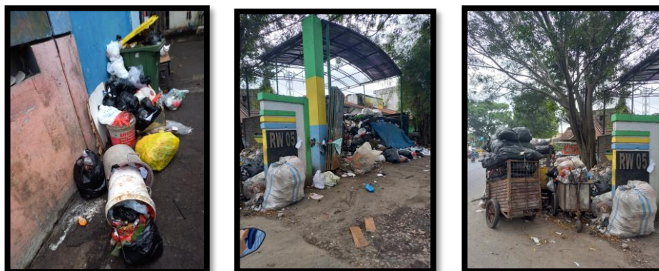
Figure 6. Piles of garbage around residential areas

Researchers also found many piles of garbage around people's homes (figure 6). Public understanding of waste processing is still relatively low. Based on the results of interviews with the community, the separation of organic and inorganic waste is also still very rarely carried out by the surrounding community. The general public already knows that keeping the river clean is a common task. However, the community still needs to be equipped with an understanding of the importance of protecting the environment and rivers so that environmental pollution does not increase.