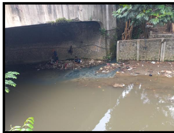
Figure 3. Water color brownish-black and shallow (Tamba, 2023)

Based on Figure 2a above as a result of observations that have been made by researchers in the Cikapundung river around Wastukencana road, researchers found a lot of inorganic and organic waste scattered in river water. In addition, researchers also found buildings (houses) on the banks of the Cikapundung river and on the roof of the house filled with garbage (Figure 2b). In my opinion, this has the potential to pollute the water of the Cikapundung river because the garbage scattered around the river water partly comes from the roofs of people's houses on the banks of the river. If this is left continuously it can result in a buildup of garbage that will be carried away by water so that it has the potential to flood.