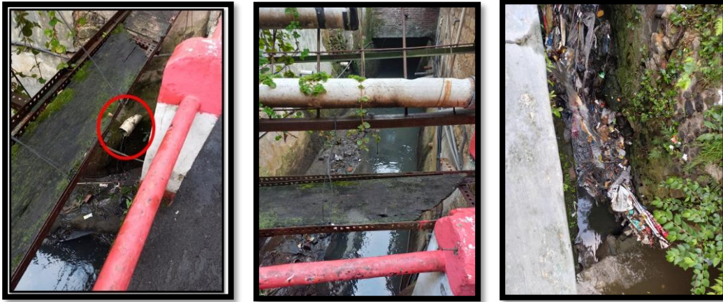
Figure 5. Sewer from residents' houses that flows directly into the Cikapundung river (The Month, 2023)

Researchers also found many piles of garbage around people's homes (figure 6). Public understanding of waste processing is still relatively low. Based on the results of interviews with the community, the separation of organic and inorganic waste is also still very rarely carried out by the surrounding community. The general public already knows that keeping the river clean is a common task. However, the community still needs to be equipped with an understanding of the importance of protecting the environment and rivers so that environmental pollution does not increase.