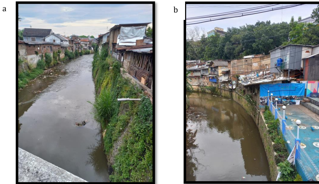
Figure 2. (a) Cikapundung river bank; (b) Houses located on the banks of the Cikapundung river

Cikapundung River empties into the Citarum Bale Endah river (Bandung Regency) and becomes one of the main tributaries that empties into the Citarum River. Cikapundung River has an area in the upstream part of 111.3 km 2 , in the middle area of 90.4 km 2 and in the downstream area of 76.5 km 2 .