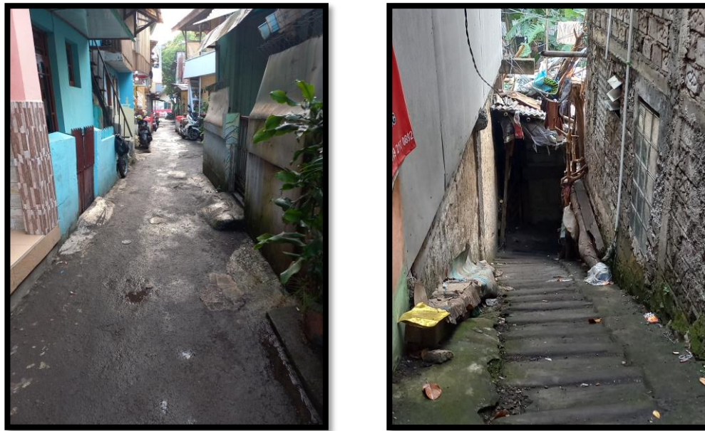
Figure 4. The condition of roads or alleys in residential areas (Tamba, 2023)

Based on Figure 4 above, it can be seen that the density of buildings is high, as seen from the density between existing buildings. The density can be seen from any house that does not have land as a yard. There is no land around the Cikapundung river, Wastukencana road, which can be used for farming because the land around the river environment is so dense with people's houses and the road around the alley is also relatively narrow. In addition, the distance that separates house buildings from one another does not exist.